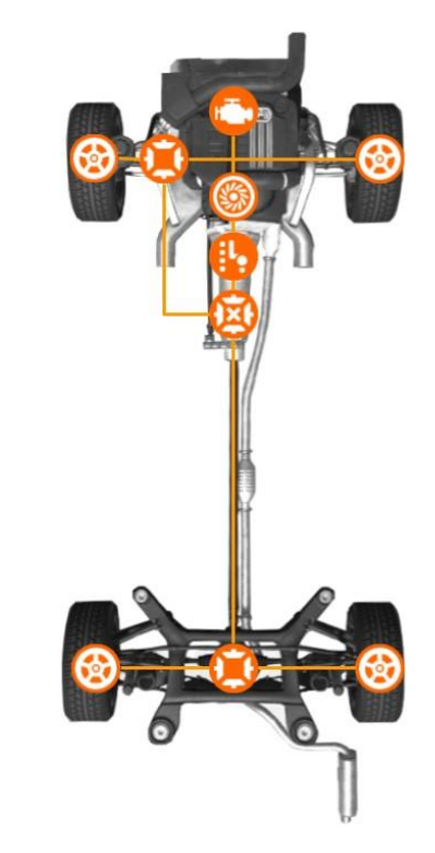
Fig. 1. Schematic representation of the powertrain simulation of the ETK800 854t in BeamNG. The mathematical model of individual compo- nents can be further subdivided but have been omitted in favor of simplicity. The individual components of the powertrain are, from top to bottom andas they are connected: engine, torque converter, gearbox, transfer case that connected to the front and rear differential.

Simulations play a crucial role in the development of autonomous driving systems since they have proven to be a cost- and time-efficient tool. Moreover, ISO/PAS 21448 [1] explicitly proposes a strategy to adopt the use of simulations to minimize residual risk due to insufficient situational awareness of autonomous driving applications. Continuous verification & validation is a key paradigm to acquire sufficient functional safety. An iterative cycle is the foundation of the software development process proposed in ISO/PAS 21448, where the use cases of the respective autonomous driving system (ADS) is repeatedly reviewed to obtain a comprehensive specification of its operative design domain. In this framework, model-in-the-loop (MIL) simulations are a cost- and time-effective tool to implement verification & validation procedures and help develop specifications that lead to safe ADS deployment. But not only ADS development relies on simulations: the performance of any learningbased applications directly depends on the quantity and