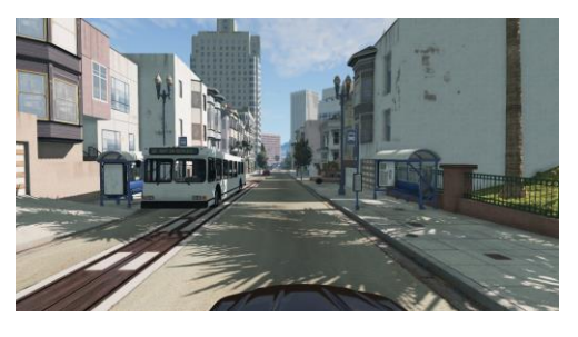
Fig. 6. Scene from BeamNG.tech's West Coast USA level, automatically generated with the help of BeamNGpy.