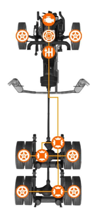
Fig. 3. Schematic representation of the powertrain simulation of the Gravil T65 in BeamNG. The mathematical model of individual components can be further subdivided but have been omitted in favor of simplicity. The individual components of the powertrain are, from top to bottom and as they are connected: engine, clutch, gearbox, first differential that distributes the power between the two-wheel pairs and the consecutive differential that distributes the power within the individual wheel pairs.